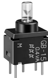
GB Illuminated Plungers

Support pins finish has been changed to comply to RoHS standards. The change applies to the series as shown above, GB Pushbuttons and GB Illuminated Plungers, and only for single pole devices with straight PC terminals.