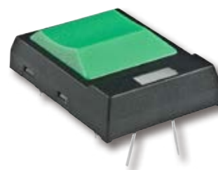
JF Series spot illuminated tactiles will have LED revisions.

1. The LED specifications for JF Series spot illuminated tactile switches will be undergoing changes. This will result in revisions to the electrical values, and will apply to red, yellow and green LEDs for standard or custom switches. Following is the comparison between the specifications before and after the changes. Effected standard part numbers are on page 2.