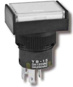
Some spot illuminated red/green models of YB Series will have LED specification changes.

Standard and custom YB switches with spot illumination and red/green LEDs are included in the change, and part numbers for effected standard models are shown on page 2.