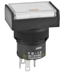
YB Series Spot Illuminated with 24V Amber LED and Resistor

Standard and custom YB pushbuttons with 24-volt amber LEDs and resistor are included in the change, and part numbers for effected standard assemblies are shown on the table below at right. The assembly consists of spot illuminated cap, built-in 24V amber LED and resistor.