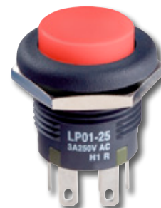
LP01 Series with Bright Red LEDs will Undergo Changes

The Bright Red LEDs for LP01 Series pushbutton switches will be changing. Both standard and custom pushbuttons are included in the revision. The change will effect electrical specifications, which are compared on the following table. Effected standard part numbers are shown below.