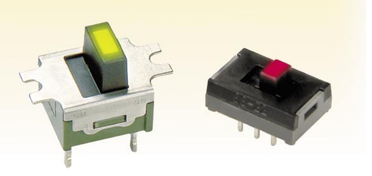
MS Illuminated Slide