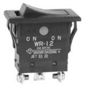
WR Rocker Before Label Change

WT, WR and WB Series with the PSE marking will have changes to the identification labels on the switch bodies, and the old logo will be replaced with the new one. The change will effect both standard and custom models, and includes all WT and WB models, and WR rockers with screw lug and wire lead terminals. The following table shows examples of the differences before and after the modification. The part number tables show standard models of each series effected by the change.