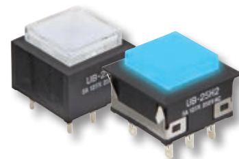
UB Series with Super Bright White or Blue LEDs will Change

UB Series Illuminated Pushbuttons and Indicators with super bright white or blue LEDs will be undergoing a change. This will result in different electrical values from those with the previous LEDs. The revision applies to standard and custom switches and indicators. Following are comparisons between specifications, and on page 2, tables of effected standard part numbers.